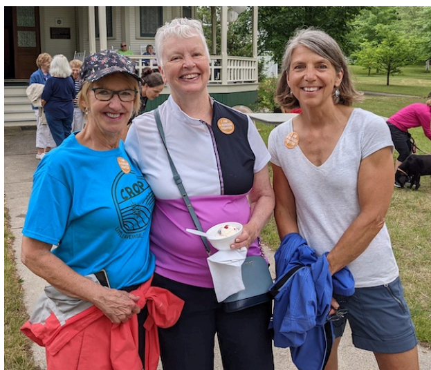
CROP Hunger Walk 2021

Want to support the upcoming Little Traverse CROP Hunger Walk on 6/25?